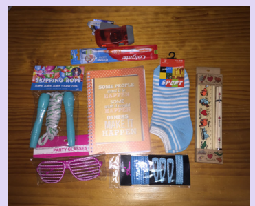
Girl Year 10-14 Box