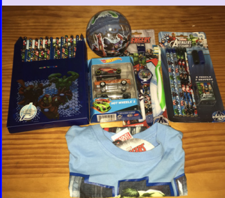
Boy Year 5-9 Box