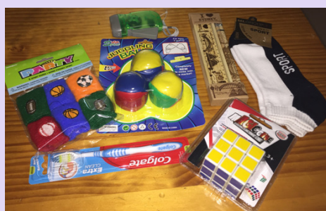
Boy Year 10-14 Box