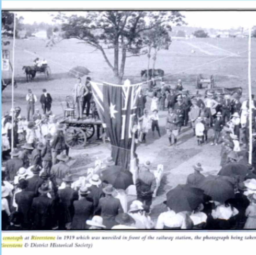
cenotaph at Riverstone in 1919 which was unveiled in front of the railway station, the photograph being taken