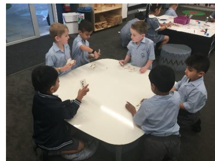
Kindergarten playing a reading game Practising recognising words

In term 4 we welcome our new Kinders for 2021 and sadly farewell our Year 6 students. We are eagerly awaiting changes in COVID guidelines so that we can open our brand new school further to our very patient parent community but at the very least can go ahead with Kinder 2021 orientation and some Year 6 graduation activities.